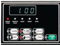
Fully programmable NetMaster™ control