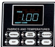
Fully programmable electronic control (EDC)